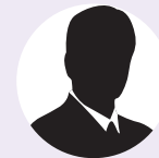
to be communicated soon...